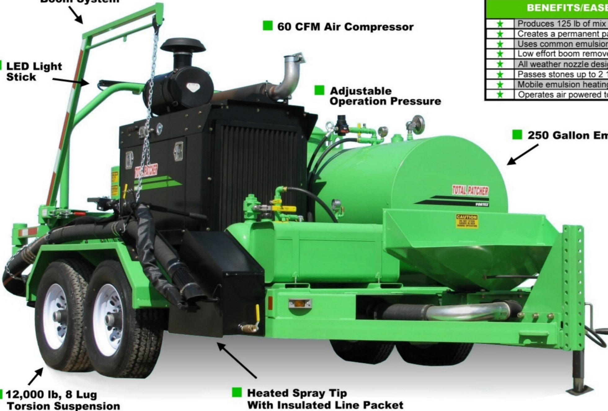
■ 12,000 lb, 8 Lug Torsion Suspension