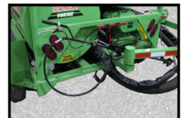
Optional Crack Seal Attachment good for sealing cracks before they become potholes.