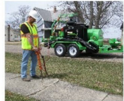
■ Air Hammer