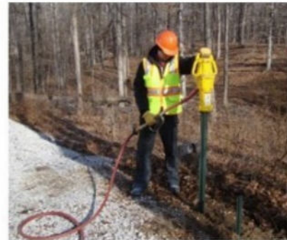
■ Post Driver