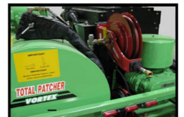
25-Foot Hose Reel for air tools.