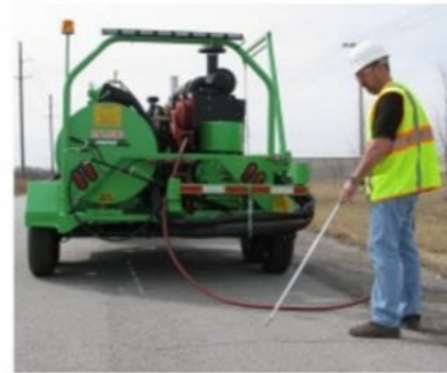
■ Air Lance