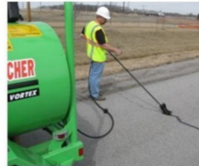
■ Crack Sealing