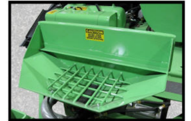
The hopper receives aggregate from the dump truck.