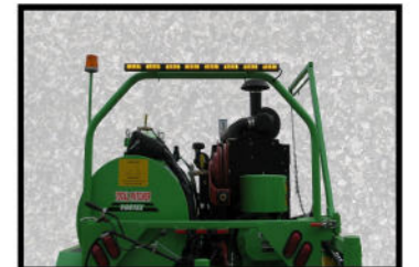
Standard Equipped LED light stick.

Specifications subject to change without notice.