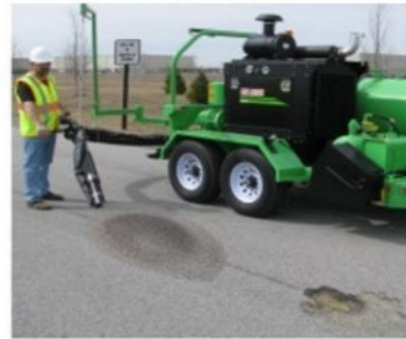
■ Street Patching