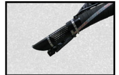
Nozzle allows precise control of spray to target area.