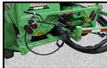
Optional Crack Seal Attachment good for sealing cracks before they become potholes.