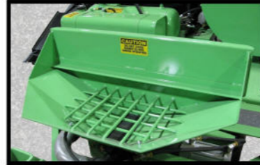
The hopper receives aggregate from the dump truck.