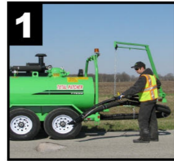
1 Clean area with on-board airstream.