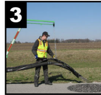
3 Apply aggregate/emulsion mixture - you're done!