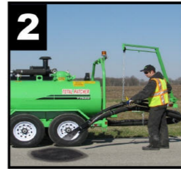
2 Apply tack coat to area to be repaired