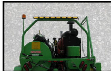
Standard Equipped LED light stick.