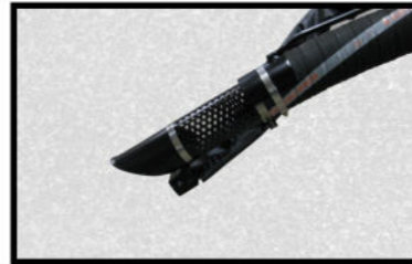
Nozzle allows precise control of spray to target area.

info@totalpatcher.com • www.totalpatcher.com