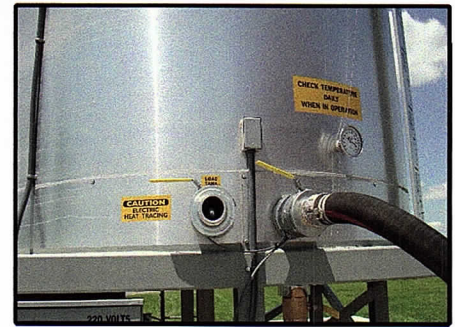
Heated & Insulated ball valves at the base of tank gravity feed emulsion to the Total Patcher.