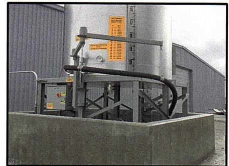
Optional hose swing boom