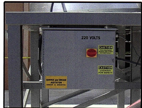
Electrical control panel and agitator timer is enclosed within a single weatherproof NEMA 3r enclosure.